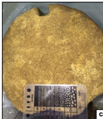
Massive structureless sandstone