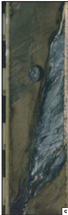
Minor sand injections